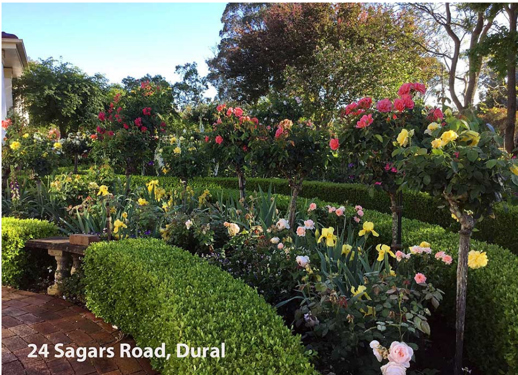
24 Sagars Road, Dural